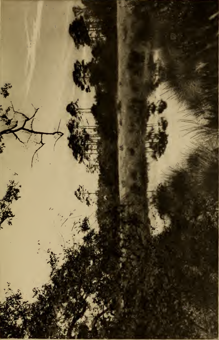
AN AFTERNOON IN FEBRUARY